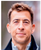
Secretary of State: Alexi Giannoulis (D) See Page 3 for profile of Alexi.

Governor: JB Pritzker (D) – Incumbent – in his first year in office, worked with lawmakers on both sides of the aisle to deliver the Rebuild Illinois capital plan, a $45 billion investment in growing jobs and building an Illinois economy. With the federal Infrastructure Investment & Jobs Act, Illinois expects to receive at least an additional $15.8 billion to pursue additional critical investments in infrastructure, including bridges and water infrastructure. When COVID hit, Pritzker worked with construction trade unions to see that the work of Illinois' construction workers was deemed "essential." He put a stop to the systematic assault on collective bargaining in Illinois, raised the minimum wage to a living wage for all Illinois workers, eliminated the state's $17 billion bill backlog, and stabilized state finances (all three rating agencies improved the state's credit rating). Learn more about JB Pritzker at jbpritzker.com .