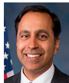
8th – Raja Krishnamoorthi (D) – Incumbent – focuses on strengthening the middle class by supporting small businesses, investing in infrastructure, and protecting Social Security and Medicare. He knows our economy works best when it works for all of us. Raja has a 96% lifetime voting record on issues important to labor and working families.