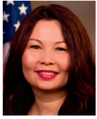
Tammy Duckworth (D) – Incumbent – no primary opponent.