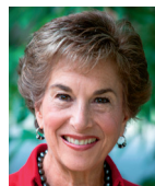
9th – Jan Schakowsky (D) – Incumbent – no primary opponent.