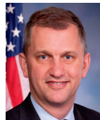
6th – Sean Casten (D) – Incumbent – is a respected scientist and independent voice for the values of the middle class. In Congress, he advocates for sensible, commonsense solutions to addressing job creation and training, health care access, climate change, and economic development. When voting on the issues, Sean has voted in support of organized labor and working families 100% of the time.