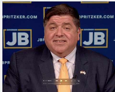
Illinois Governor J.B. Pritzker in video address to the IUPAT Central Regional Conference on August 31, 2022, speaking about his administration's record on issues important to organized labor.

More recently, the legislature and Pritzker produced a bill that closes wage theft loopholes that were benefiting non-union construction contractors. On June 10, 2022, House Bill 5412 and its trailer bill, House Bill 4600, were signed into law. Both bills amend the Illinois Wage Payment and Collection Act (WPCA) to make primary contractors, in certain situations, liable for any debt owed by a subcontractor – at any tier. This puts primary contractors on the hook for wage theft committed by their subcontractors.