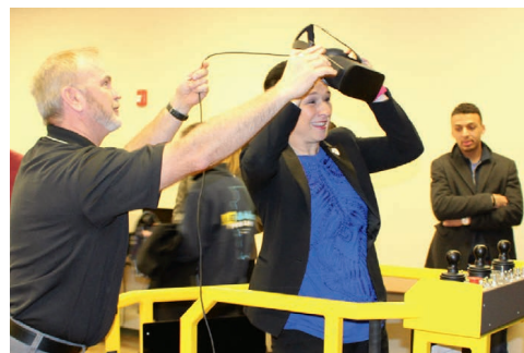
Illinois Comptroller Susana Mendoza, who signed an Executive Order in 2019 that declared her office would hold up state payments to companies that violated the Prevailing Wage Act, seen here during her visit to PDC 30 in 2018 when she tried out the virtual aerial lift used by the NCIFTI.

In addition to stopping the systematic assault on collective bargaining in Illinois, Pritzker and pro-labor legislators in Springfield raised the minimum wage to a living wage for all Illinois workers. Signed into law in 2019, the legislation paved the way to a significant increase of Illinois' minimum wage. Since that legislation was signed, there have been four increases in the minimum wage. On January 1st of this year, the state's minimum wage went up to $12 an hour. The rate will continue to increase on January 1st each year until it hits $15 per hour in 2025.