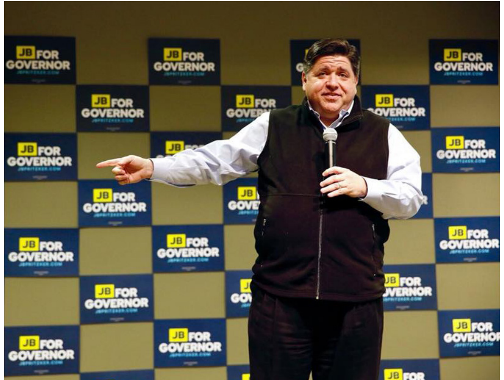
JB Pritzker speaking to voters at PDC 30 headquarters on February 5, 2018.

Back in Illinois, he was also committed to dismantling decades of progress by organized labor. His well-publicized plan included reducing obligations on employers to make their workplaces safe and cover the costs of workplace injuries and illnesses; encouraging local governmental agencies to ignore their